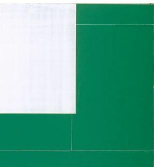
开放/投降 2009 布面丙烯 91.5 x 198 cm