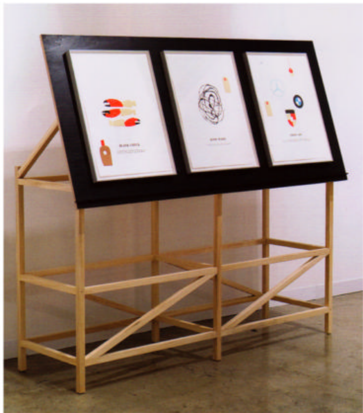
Blank Check, Blow Hard, Tight Ass 2007 Letterpress on paper, wood 170x197x66 cm

Brannon both pays homage to and undermines the 1950s – the most confident decade in the history of the USA, when everyone smoked, alcoholism was the norm and disappointment was admitted to only in novels.