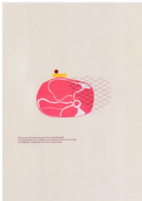
Top: Bad Manners 2008 Letterpress print on paper 56x41 cm

Halfway across the intersection you catch yourself in mid-thought. The unfinished plate. The second house. A too tight watch. A tap on the shoulder. He wouldn't dare. He hasn't the nerve. This is my sand castle.