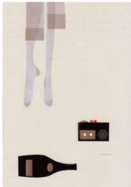
Top: Regrets Only 2008 Silkscreen print on paper 61x46 cm

Guess. No guess again. Think back. No that's not even close. Remember when I told you I did something I shouldn't have done? In New York. That guy in the piano bar? Yeah. Well I did. I fucked him. And he's here tonight. And you were right. He is the author.