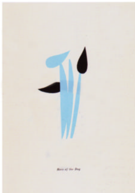
Top: Hair of the Dog 2006 Silkscreen print on paper 76x58 cm

• That's not what I'm saying • You've got it all wrong • It has nothing to do with ... I don't know the first thing about ... I've never even been to ... Now pull yourself together • You know I wouldn't ask if it wasn't important • It's nothing you haven't done before •